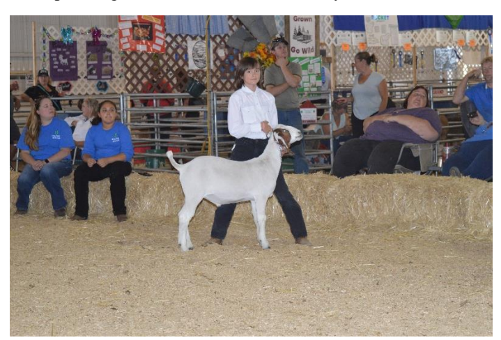
Figure 1. Market Goat class.

Youth with residency in another state may enroll in Washington State 4-H, as long as they follow their own state's minimum age policies. Youth may not be simultaneously enrolled in the same 4-H project in another club, county, or state. For example, youth may not be enrolled in the 4-H Market Beef project in both Oregon and Washington. Contact local county Extension offices when planning to enroll from another county or state.