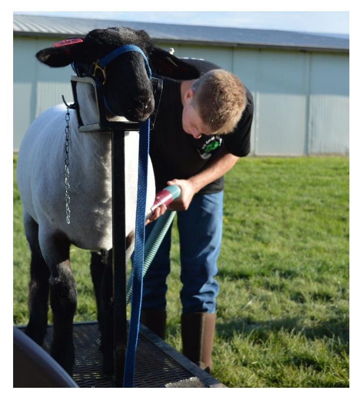
Figure 6. Fitting a market lamb.

There are basically two types of buyers at the market sale of fairs and shows. Buyers may purchase an animal and have it processed at a local butcher. Some fairs and shows will call individuals that purchase animals for home consumption "take out buyers." Take out buyers pay for the entire price of the animal as well as the cost to process the animal at a local butcher.