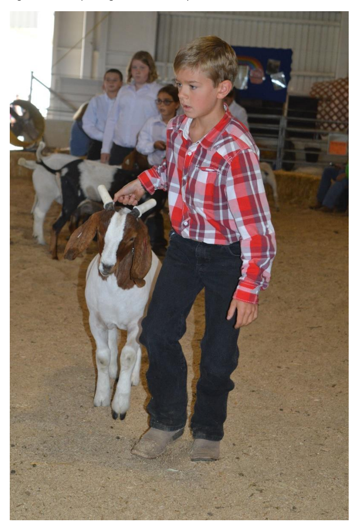
Figure 4. Market Goat class.