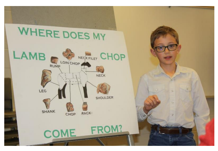
Figure 3. Public speaking contest.

livestock animal. Table 1 lists the recommend ages and weight ranges for each 4-H market livestock project. Individual counties may have different minimum and maximum weight requirements.