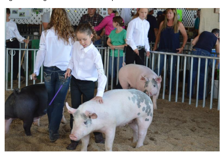
Figure 7. Swine Showmanship class.