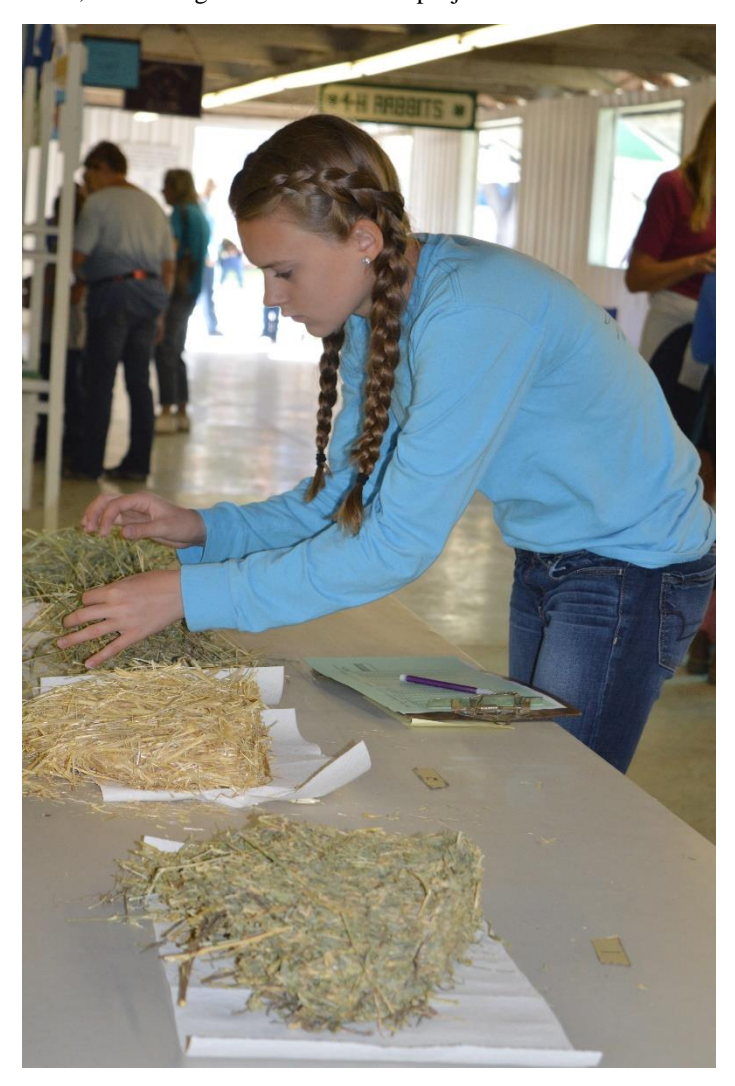
Figure 2. Judging forages.

Before livestock are purchased, it is important to review all requirements for purchase, ownership, participation in a fair or show, and selling a market livestock project at a 4-H livestock